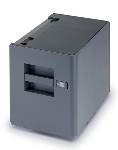
3,000-SHEET PAPER FEEDER PF-7120 Ideal for large print runs in A4.