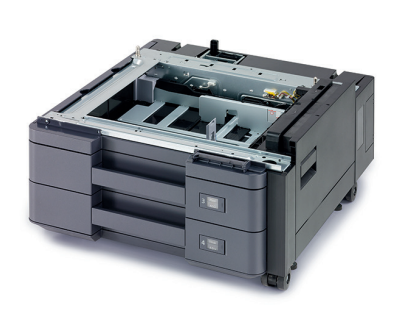
FEEDER PF-7100 Ideal for paper sizes between