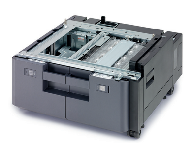
2X 1,500-SHEET PAPER FEEDER PF-7110 Supports A4, B5 and letter formats.