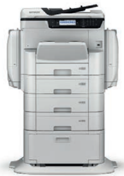
With option of large or standard ink packs.