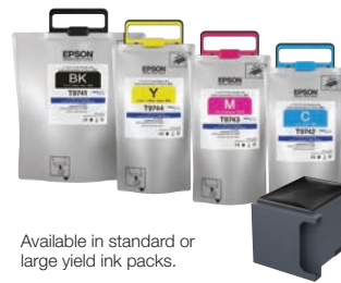
Available in standard or large yield ink packs.

With Epson's Replaceable Ink Pack System (RIPS), exorbitant printing costs are a thing of the past. The revolutionary RIPS features four ink supply units and a waste ink box, giving you uninterrupted printing of up to 86,000 pages in black or up to 84,000 pages in colour. With such page yields, you enjoy maximum cost savings and minimum running costs.