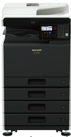
Base Unit + Options (4 Paper Trays)

*The measurement of the on-screen MFP may not appear exact in some cases.